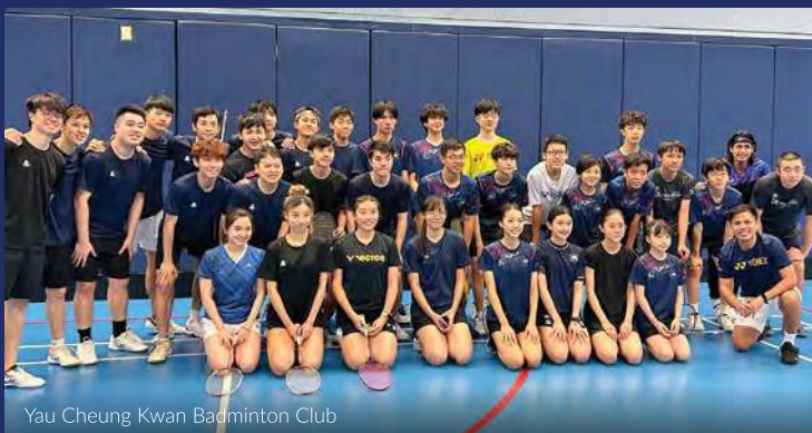
Yau Cheung Kwan Badminton Club