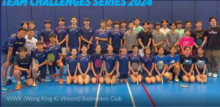
WWK (Wong King Ki Vincent) Badminton Club

In order to prepare for upcoming local team tournaments, the junior squad has started their team challenges series in May. These regular team matches against, older and stronger players will help our junior players to prepare physically and psychologically for their games and be able to perform well under pressure.