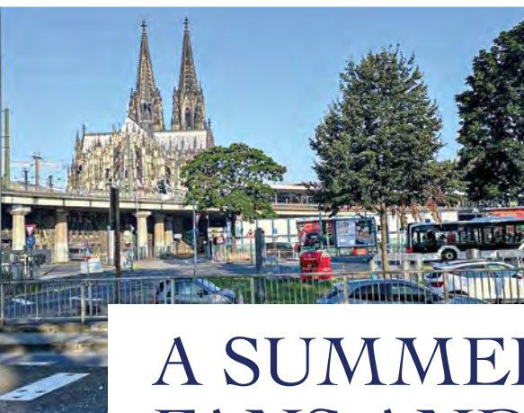
The famous twin spires of Cologne Cathedral.