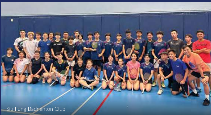
Siu Fung Badminton Club