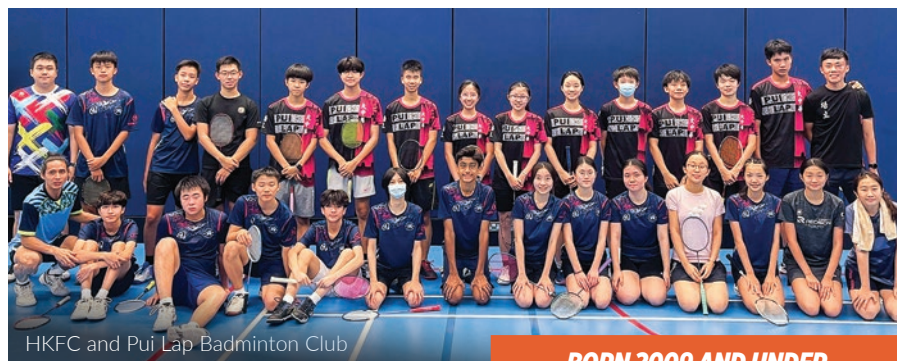
HKFC and Pui Lap Badminton Club

HKFC Junior Badminton Team Series for year 2006 and 2009 is gradually finishing up with the group stage and approaching the semi-final. With the support of local clubs that encourage junior badminton development programs, the team series provides ample opportunities for HKFC junior badminton players to put practice into games and prepare for upcoming tournaments. It is also a great opportunity for players to strengthen team building and practice leadership through captaincy assignment. Our teams are currently ranked highest 2nd in both years and good luck to all the players!