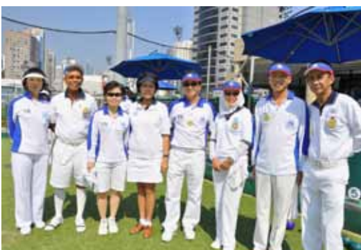
BELOW: One of the HKFC teams playing against Team Phillippines