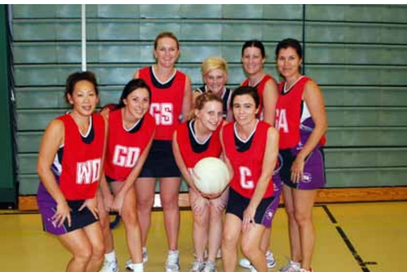
Tornadoes team photo