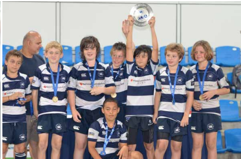
Under 12 FC Blues 1 Plate Winners