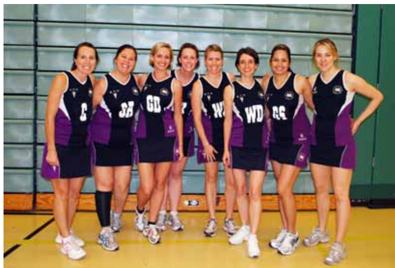
Hurricanes team photo