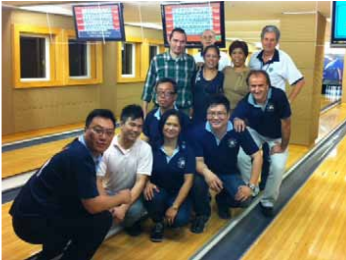
HKFC played in a recent HKICTB league match with a visiting team from the Hong Kong Club (HKFC is currently in second place of the league, with only two more matches to go)