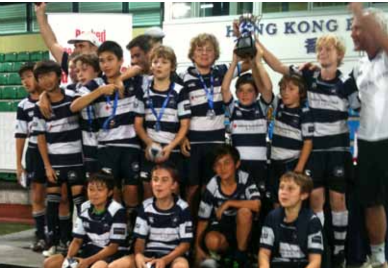
Under 12s FC Blues 2 Bowl Winners