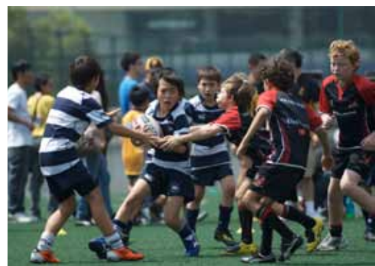
Under 10s in action against Valley

Hornet had a terrific tournament winning all their games against the best of the other clubs and firmly establishing themselves as the best team at this age group. They scored some marvelous tries and continuously harried and pushed the opposition back whenever they got the ball. Their best game was against DeA who they had drawn against previously